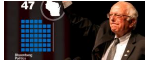
By the Numbers: Bernie Sanders' Delegate Math