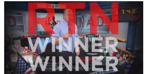
Cramer Remix: The stock to buy next week