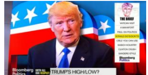
Empire State Tumult: GOP Week in Review