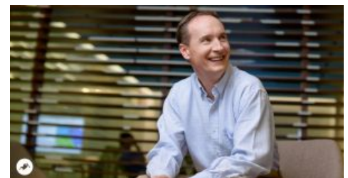
Motley Fool Issues Rare "Double Down" Stock Alert f Sponsored The Motley Fool