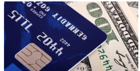
Paying Credit Card Interest? Big Mistake Sponsored NextAdvisor.com