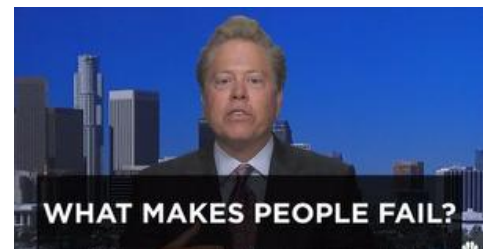
Cramer's Exec Cut: Key to failure vs. success