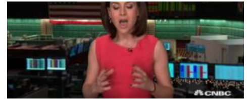
Crude oil prices see big spike

Skip the poli sci, go straight to IR. Payscale says this is one of