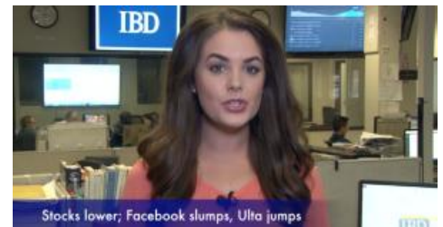
Stocks Lower For Week; Facebook Slumps, Ultra Jumps